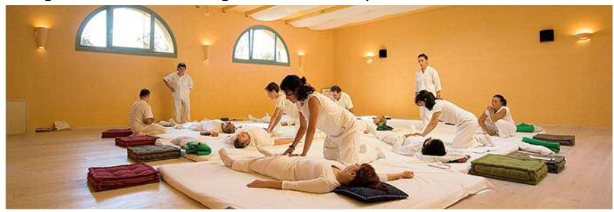
Figure 2: SHIATSU WORKSHOP

The participants work in pairs on mats on the floor, one receiving and the other giving Shiatsu. A professional trainer teaches the principles of Shiatsu: awareness, listening to the language of the body, working unintentionally, leaning in stead of pressing. The participants use their palms and thumbs following the meridians through the whole body.